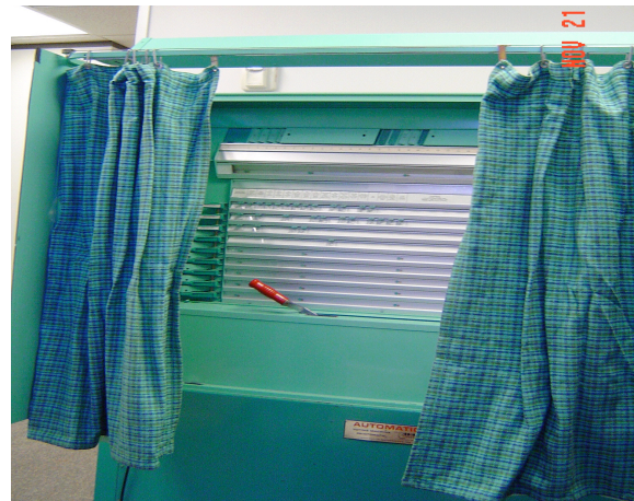
Figure 2. Mechanical lever machine

Each voting method used the races and propositions used by Everett, Byrne, & Greene (2006). Candidate names were produced by a publicly-available random name generator ( http://www.kleimo.com/random/name.cfm ). The 21 offices ranged from national races to county races, and the six propositions were real propositions that had previously been voted on in other counties/states, and that could easily be realistic issues for future elections in Harris County, TX, the county in which this study was conducted.